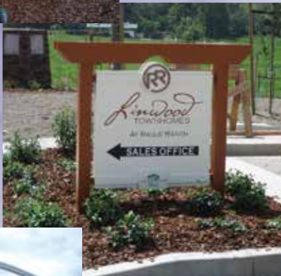
Post and panel